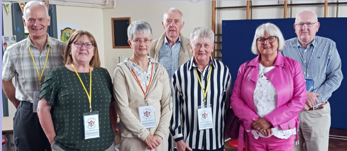
New Team at Moyle PS, Larne