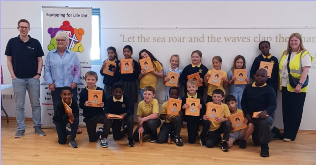
Pupils from Wheatfield PS taking part in the ‘Be Inspired Day’ at the Amy Carmichael Centre, Cambrai Street Belfast