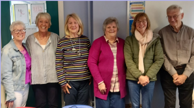
Eden PS Team , East Antrim